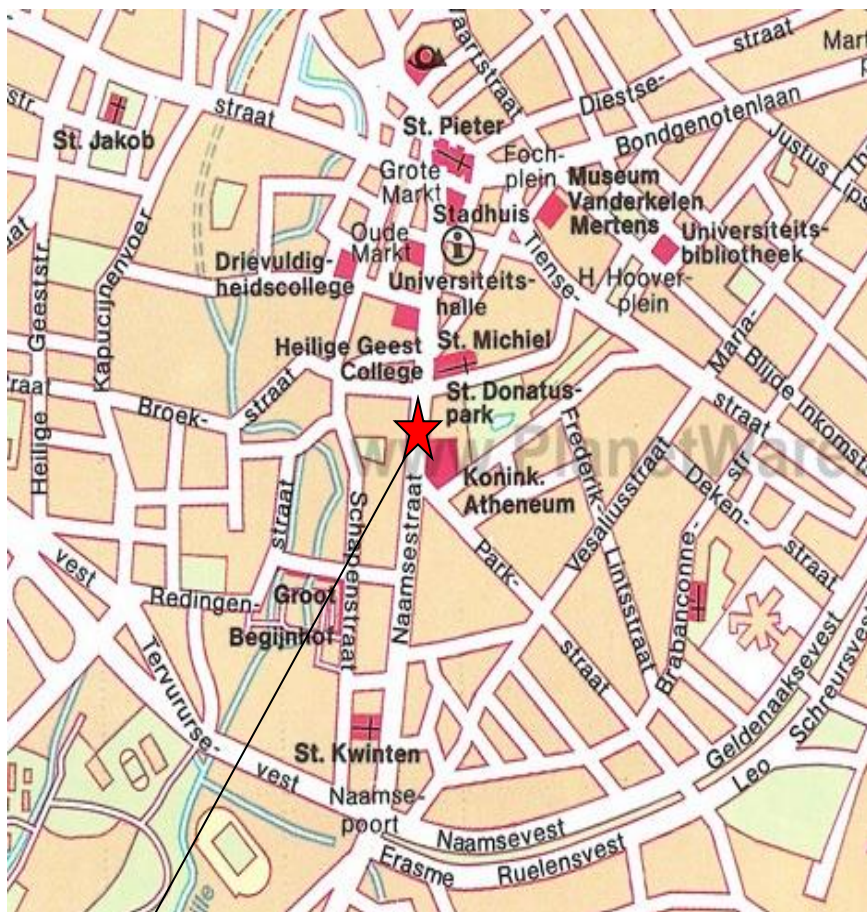
American College (Residence)